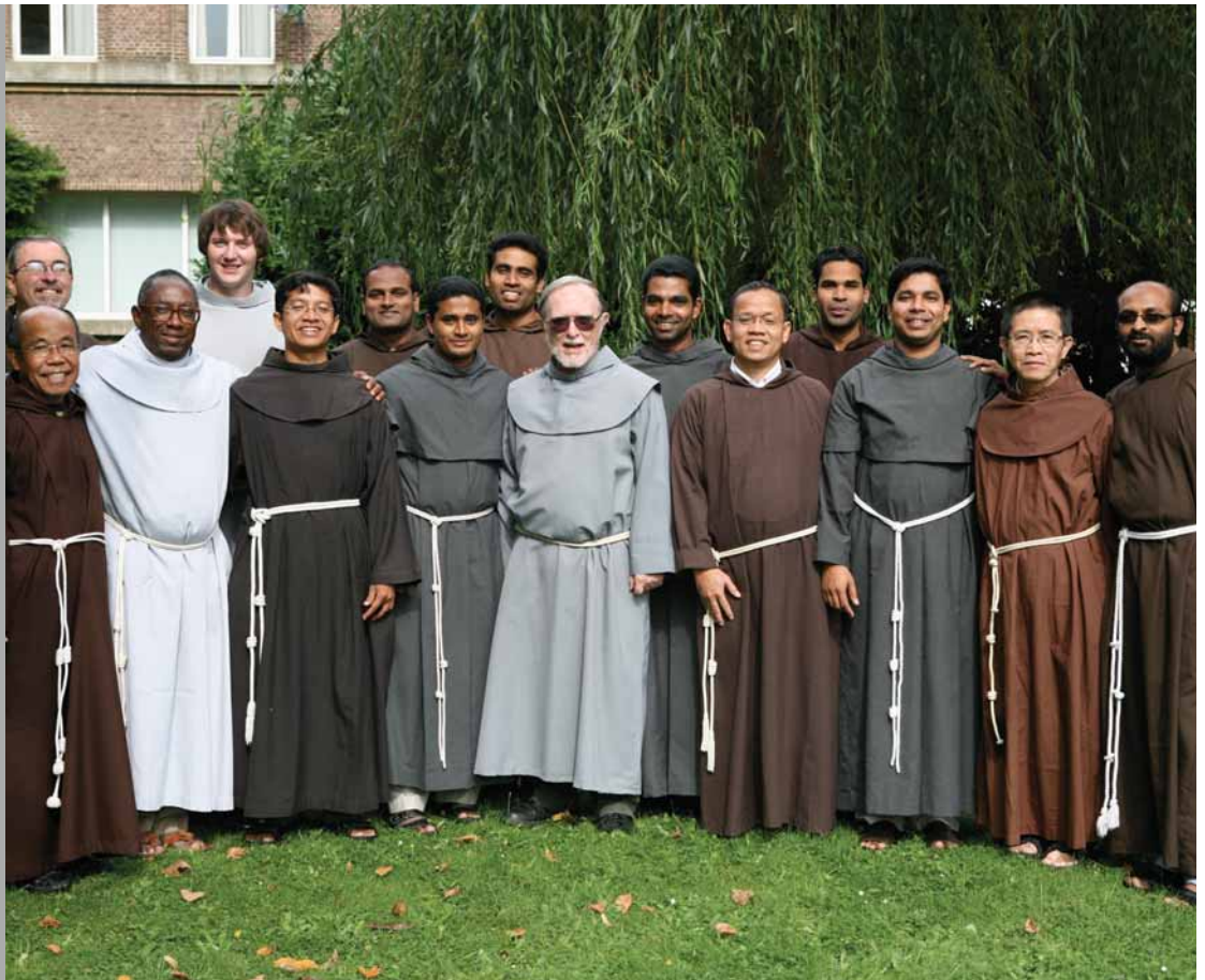
Photo of the group of participants in the course, along with their Formators